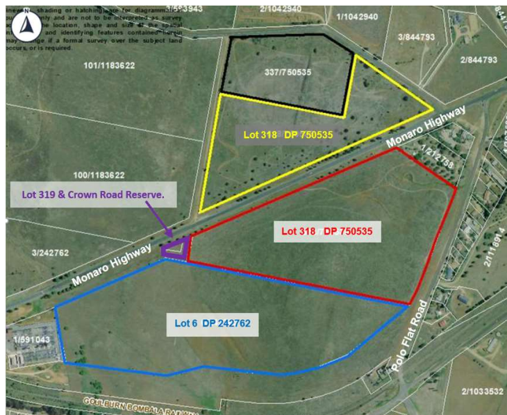
Figure 1 – previous Lot and Deposited Plan numbering.